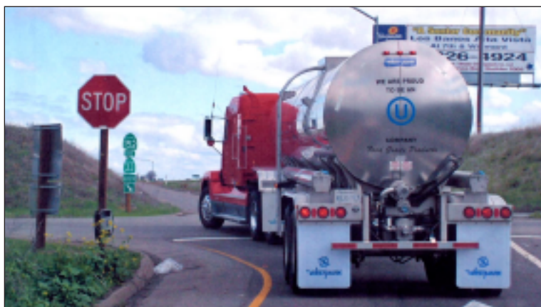
THE Ⓢ ON THE GO...

A limited number of MONTANA SPINACH produced by Montana Food Industries – Tarzana, CA has been distributed while bearing an unauthorized Ⓢ symbol and is being withdrawn from the marketplace. Consumers spotting this product are requested to contact the Orthodox Union at 212-613-8241 or via email at kshalerts@ou.org .