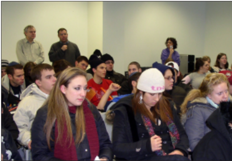
Seattle and Vancouver Jewish Student Union club members have their questions answered on kosher concerns.

The new initiative VISIT U is a companion to the highly successful ASK U program. Both programs are made possible by the Harry H. Beren Foundation of Lakewood, NJ, which provides financial support to a wide variety of educational programs of OU Kosher.